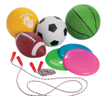
Outdoor Toys & Games