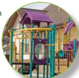
Leo's House playground

April was Child Abuse Prevention Month and a busy one for Providence House! We launched a new awareness campaign, hosted two of our signature annual events, participated in an international festival, and received a very special gift from one of Cleveland's newest Tribe members!