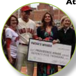
Swish's Wishes check presentation

At the Cleveland Indians Home Opener on April 8th Providence House was awarded a $75,000 gift by Nick and JoAnna Swisher through their Swish's Wishes Foundation. We were thrilled to be a part of the Opening Day ceremonies and cannot begin to express our sincere thanks to the Swisher Family! Thanks for joining us at our Luncheon, too!