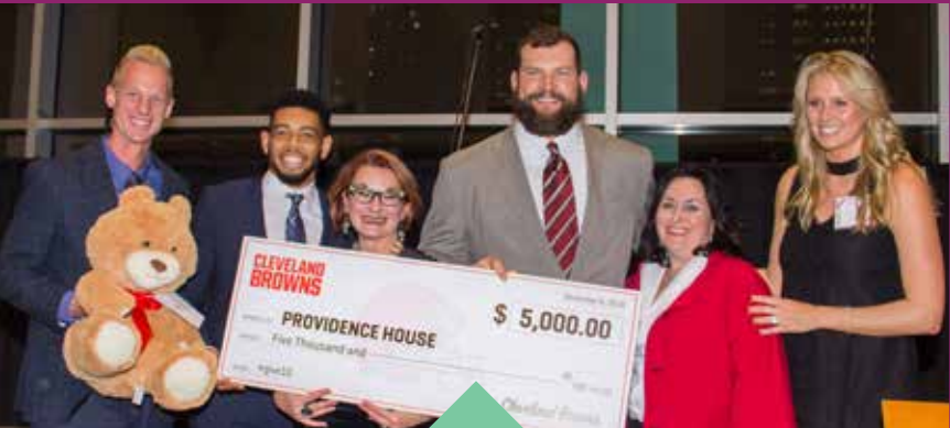
Deck the House December 11, 2018