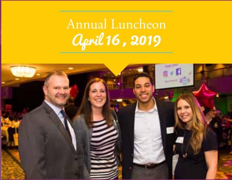
Annual Luncheon April 16, 2019